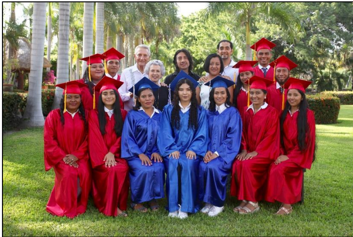
Roca Blanca July Graduates

Although 2020 has proven to be a very challenging year, most of LTI's international training sites continue to press forward finding creative ways to train their students. Mexico had a total quarantine from March 28th - June 1st. So, Roca Blanca Mission Bible School completed their training online using Facebook Live and in July, held a graduation for 12 students.